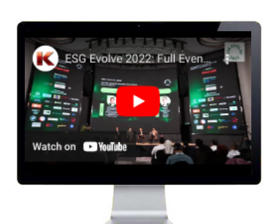
Double click on screen to watch the event video