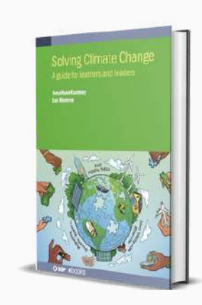
Solving CLIMATE CHANGE: A GUIDE FOR BEGINNERS & LEADERS (IOP Publishing Ltd, 2023)

There are a lot of climate books out there today, but if i had to pick just one for my shelf, this would be it. If you're a climate investor or entrepreneu, this is the single must-have resource for ensuring that your decision-making is grounded in fact and that your efforts are directed to the areas of highest impact.